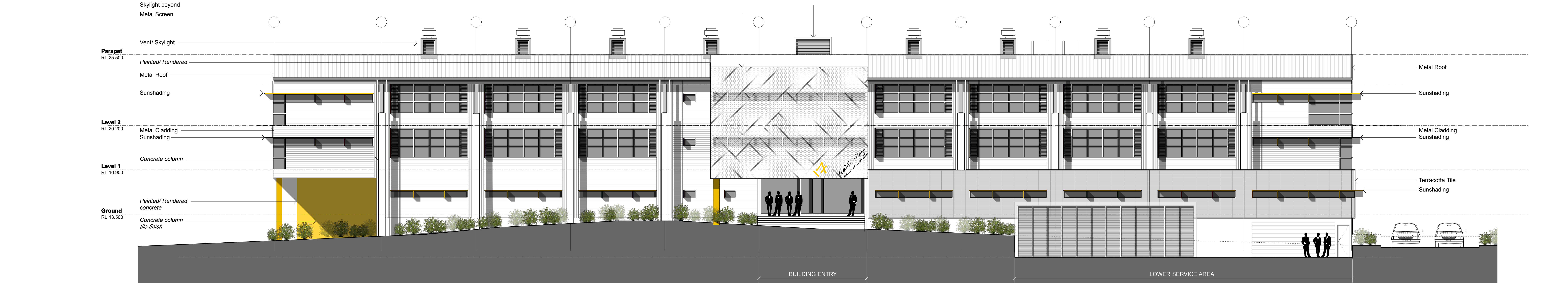
04 ELEVATION 4 - South UWSCollege Scale: 1:100 @ A0

Notes - Architectural drawings to be read in conjunction with consultant documents, including survey. - All dimensions are in millimetres unless stated otherwise. - Do not scale drawings. Use figured dimensions. - Walls and columns are located on centre line or face of grid unless noted otherwise. - Check and verify all levels and dimensions on site prior to commencement of any work. - This drawing is copyright and must not be retained, copied or used without the permission of Baker Kavanagh Architects.