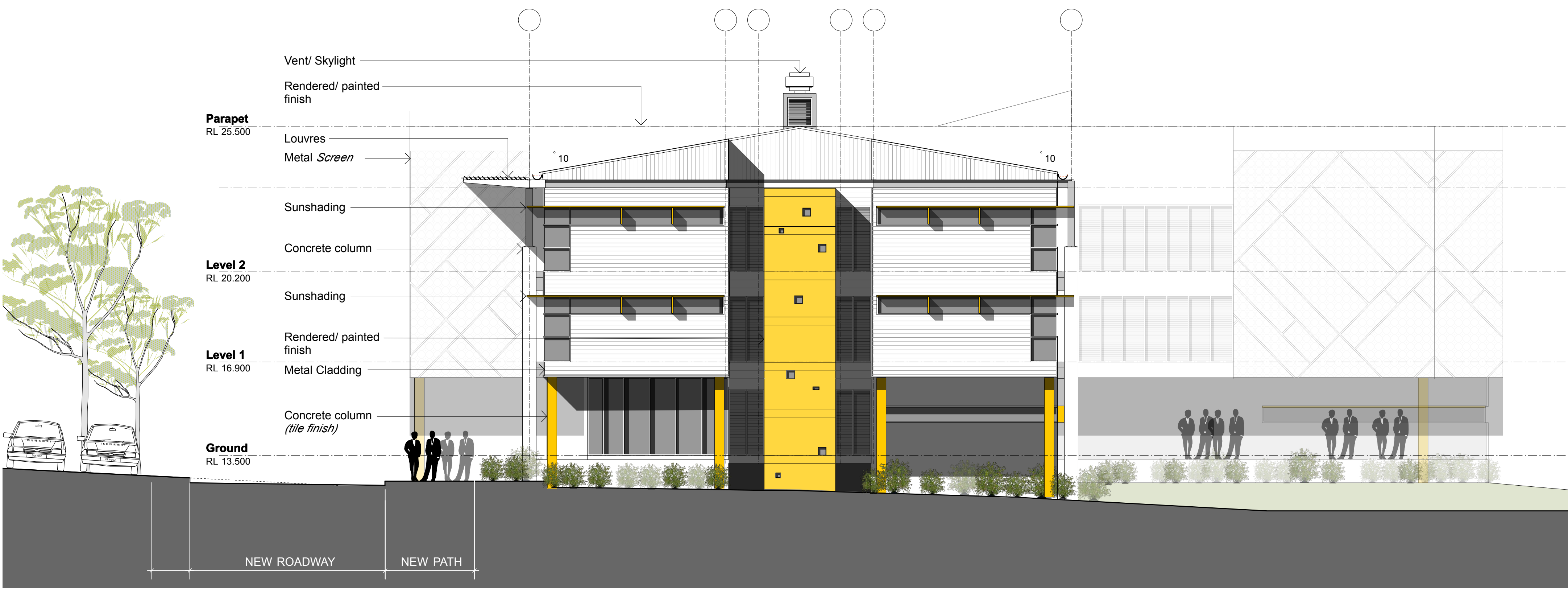
01 ELEVATION 1 - West UWSCollege Scale: 1:100 @ A0